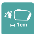
Short Working Distance