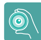
Handheld Camera Head