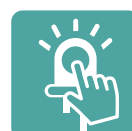
One-Button Fill Light