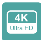
4K Output Resolution