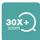
30X Optical Zoom